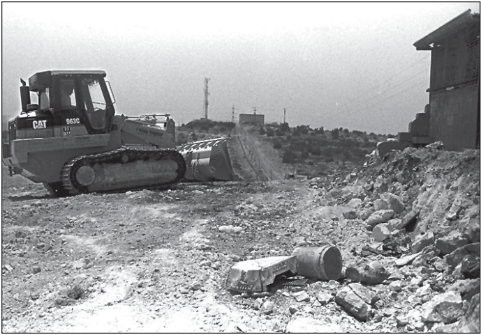
A bulldozer razes land for the path of the Wall.

Bank — will be isolated between Wall and Green Line, and 200,000 Palestinians in East Jerusalem will be entirely cut off from the rest of the West Bank 3 .