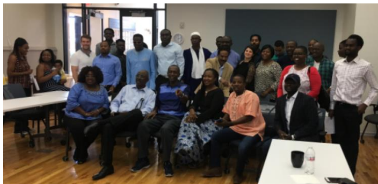
The New African Immigrants Commission meets in Cincy.

This Sunday, the Fairfield Friends Meeting in Camby, Indiana will host a Bystander Training facilitated by AFSC. Friends write that “the training can help you to defuse the situation and show how you are an ally for persons who are oppressed in our country.” In Indy, AFSC’s Book Club will discuss The New Jim Crow on October 22. Earlier, the Muslim Youth Collective curated an art exhibit entitled Muslims Aren’t Interested in Being Afraid .