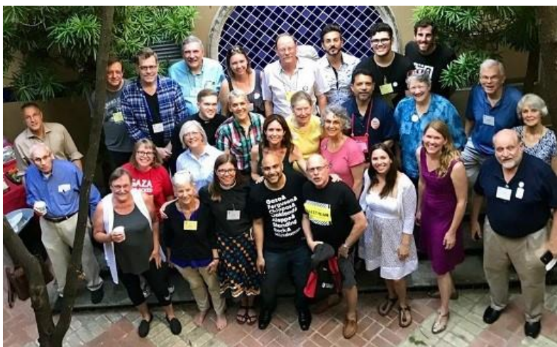
Episcopalians (and some AFSC staff) gathering in Austin, Texas take a stand for Palestinian rights.