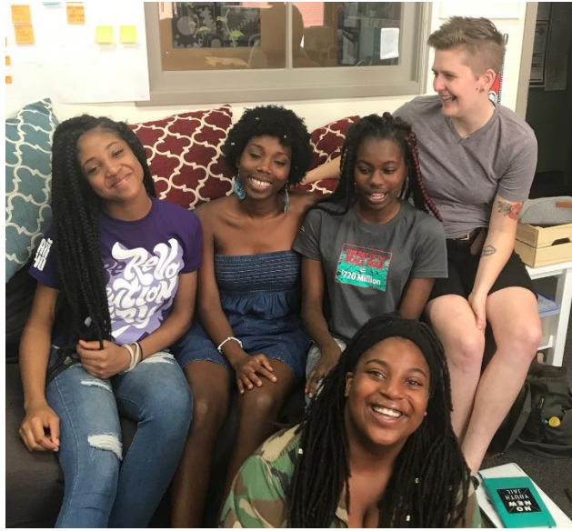
AFSC Chicago summer interns and staff