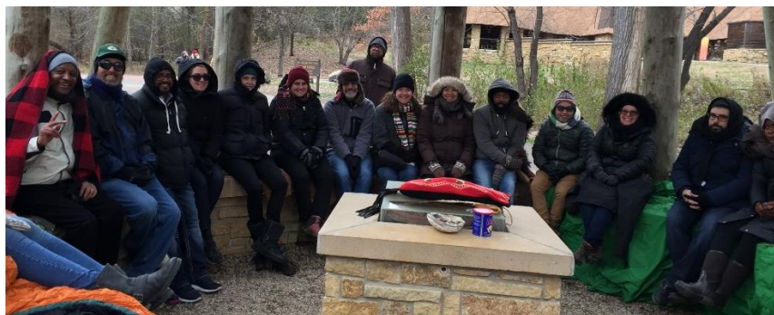
Midwest staff huddle during a Sacred Sites Tour in the Twin Cities as part of their recent staff retreat.

AFSC co-hosted a solidarity vigil for the Jewish community following the synagogue shootings in Pittsburgh. A discussion on Hanukkah and the Politics of Food is set for December 3.