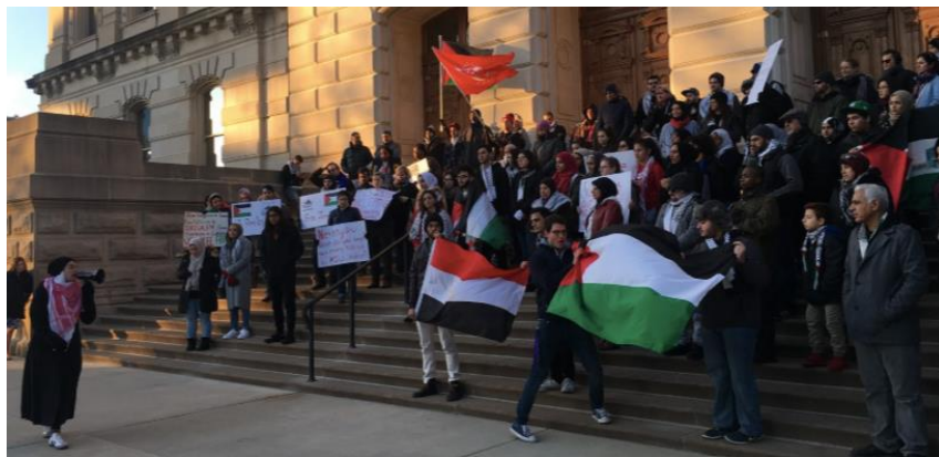
People in Indiana rally against Islamophobia and oppression.