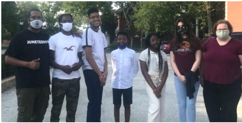
Students and AFSC staff in St. Louis.