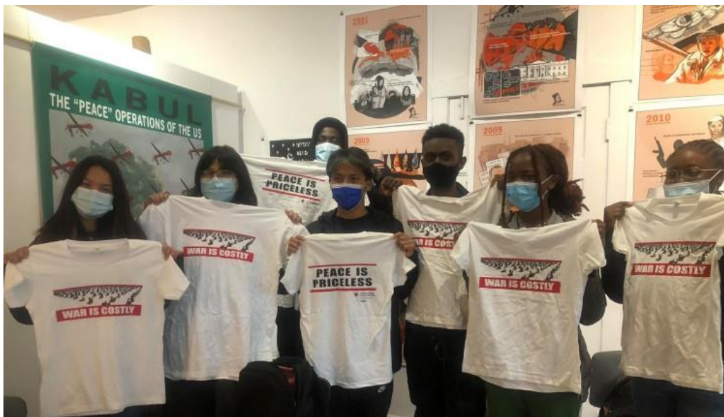
Sullivan High School Social Justice Club students with AFSC & Dissenters