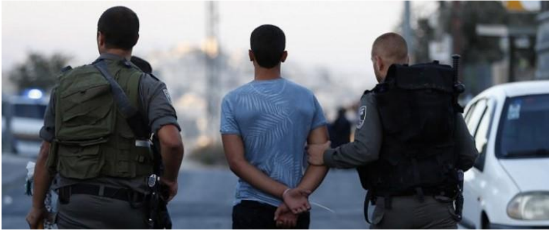
A Palestinian youth arrested in East Jerusalem