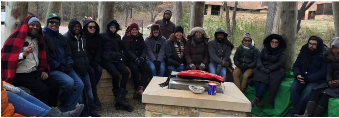
AFSC staff in the Midwest can handle the cold.