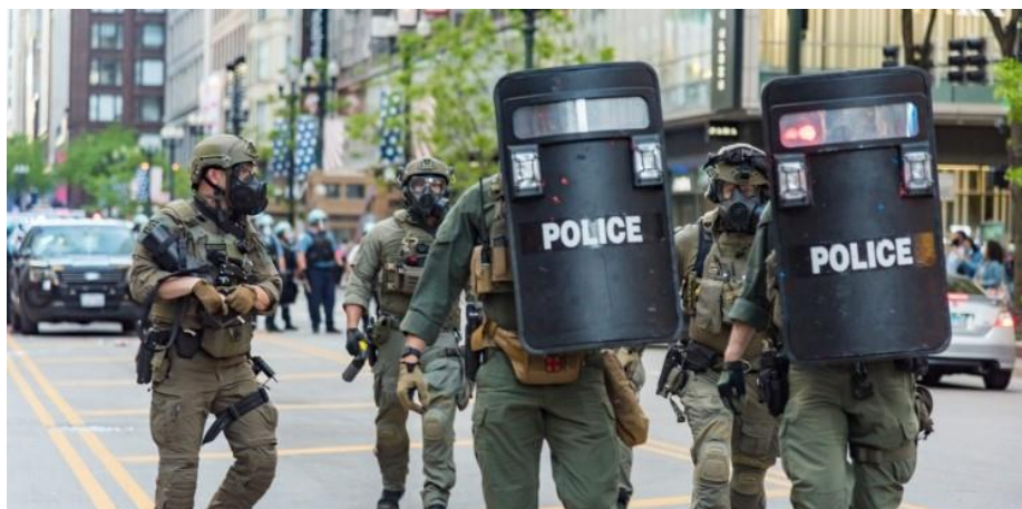
Police in riot gear at a protest in Chicago.