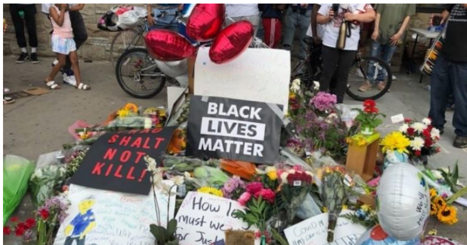
Memorial to George Floyd in Minneapolis

Highlights of work from around the region