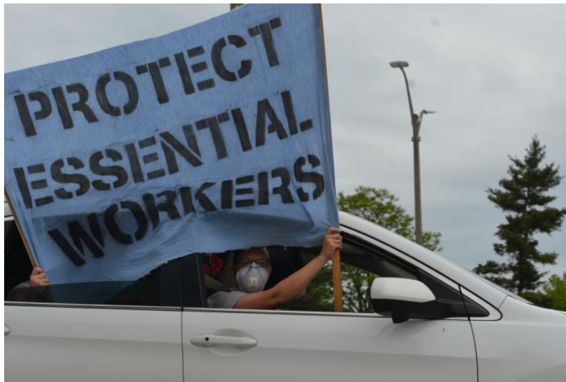
Iowans show their support for worker health and safety.