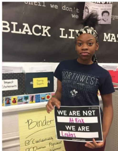
Young people of color proclaim “We are not at risk.”