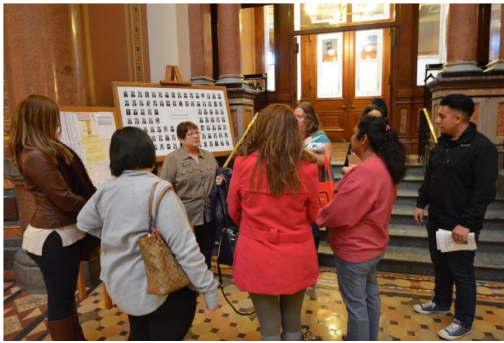
Iowans speak with a state legislator in 2018 during an AFSC training on immigrant advocacy.