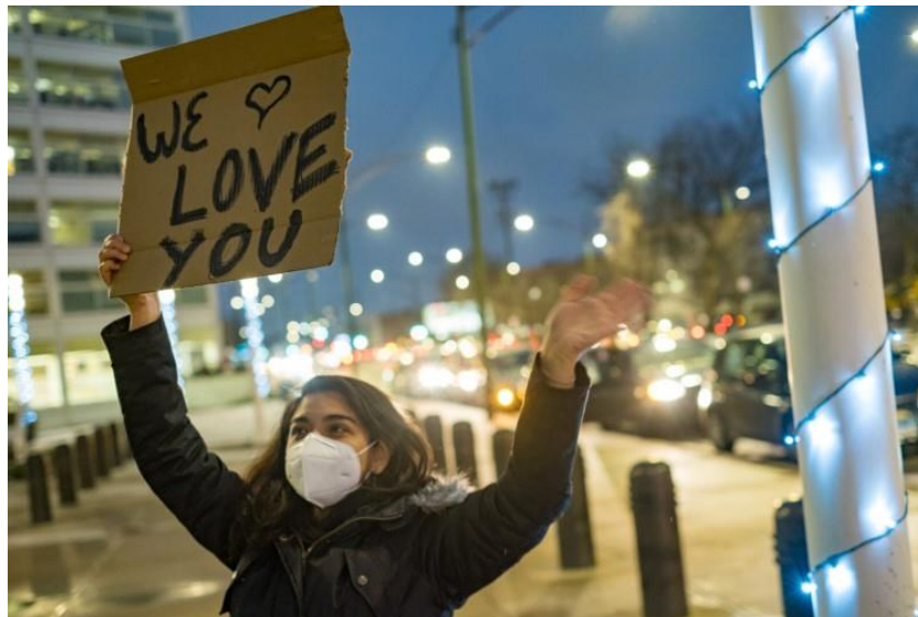
#FreeThemAll action at a youth detention center in Chicago.