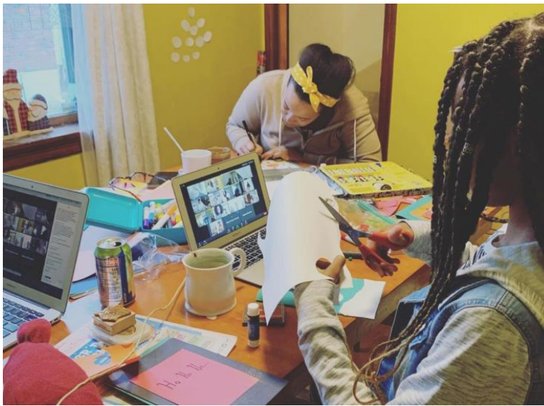
Holiday card-making for justice-involved youth in St. Louis