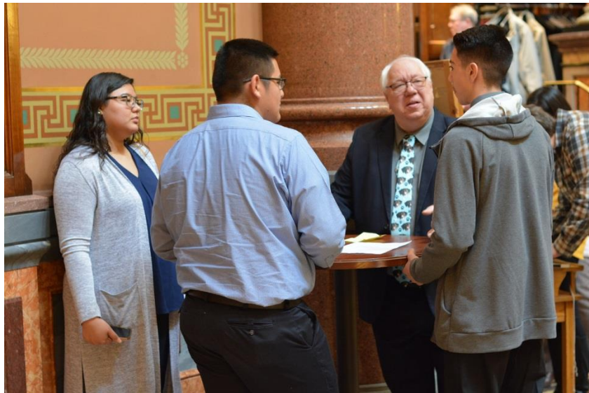
Iowa youth lobby a state legislator in support of immigrant rights.