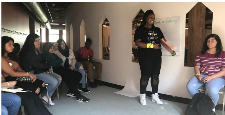
Young people involved with #NoCopAcademy in Chicago