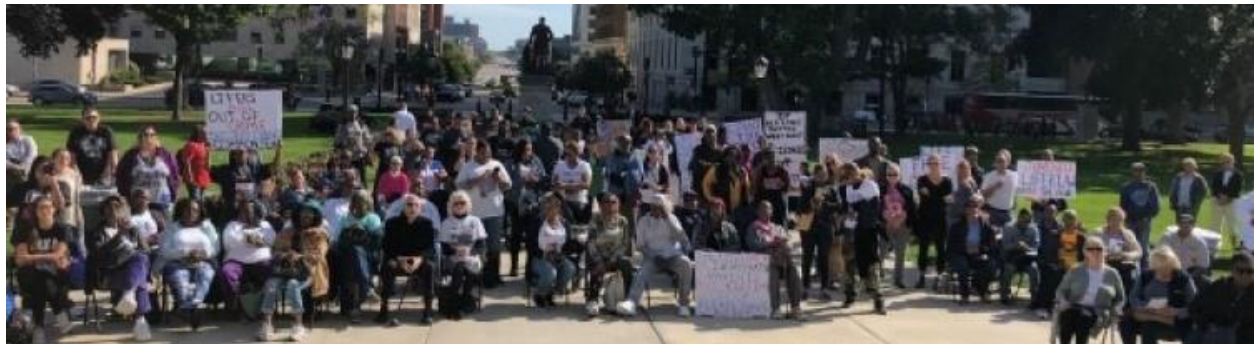
National Lifers of America rally in Lansing, Michigan

“Teamwork makes the dream work,” said one student. “I learned that everyone has great ideas, but when we come together, we can be better.” Read more .