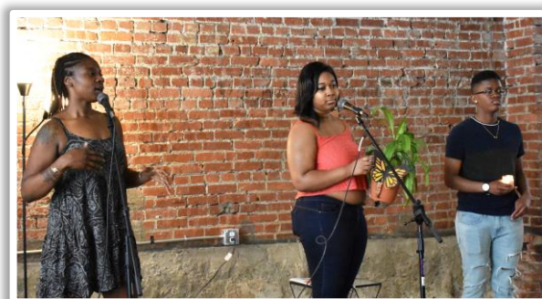
YUIR welcoming the space with their opening ritual.

*yelders = youth + elders. Shout out to Seattle YUIR for this phrase!