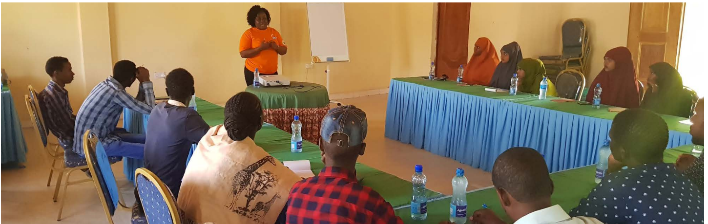
Youth leaders from Somalia take part in a peacebuilding training in Dadaab refugee camps.

AFSC supports trauma healing programs in both Kismayo and Dadaab, reaching a total of 9,058 community members since 2018. About 4,595 of those individuals were reached through radio broadcasting of trauma healing messages. Working closely with Refugee Consortium of Kenya (RCK), our program includes training and ongoing support for community-based counselors; hosting community forums on trauma management and peacebuilding; facilitating dialogues among youth, religious leaders, and community elders; and helping young people build skills to help themselves and others heal and work through conflicts peacefully.