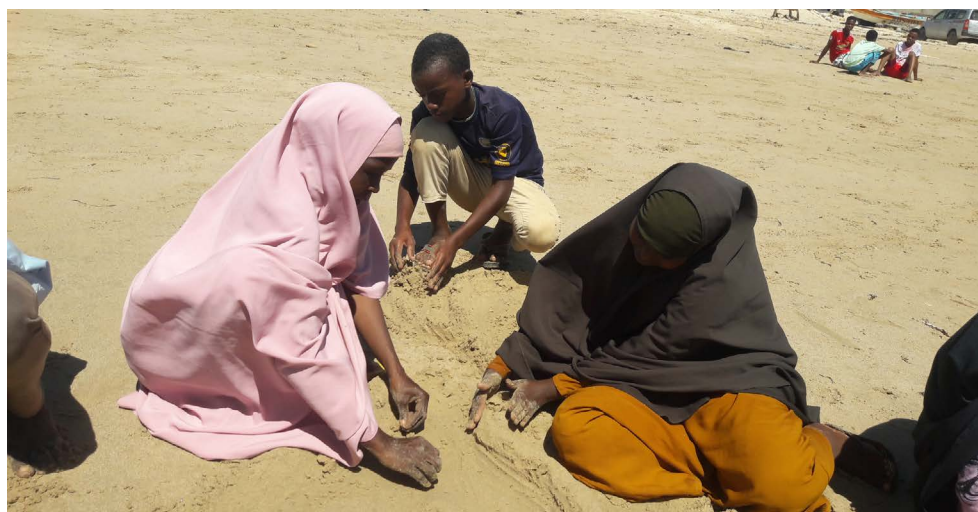
Youth peace forum in Kismayo, Somalia.

With support from AFSC and partners, youth bring positive transformation to communities in Kismayo and Dadaab.