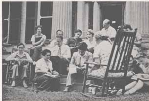
German-American fellowship at Aberdeen Camp on the Hudson

With the enlarged staff, it should be possible to give adequate personal attention to the innumerable calls upon us. Because we are only just getting organized and because public opinion in America is only just beginning to realize the actual state of affairs, these projects are still in the stage of investigation and consultation.