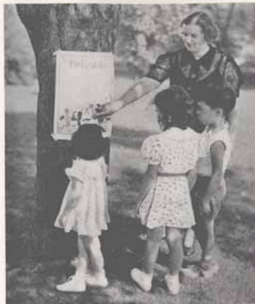
Not only adults, but children as well, learn the meaning of world friendship from Peace Volunteers

Most Units begin their work with a survey of the town or county. Almost immediately, through the help of sponsors, the Volunteers speak before young people, men's service clubs, churches, farm and labor groups. Study groups which meet weekly are set up for intensive reading and discussion. Over the local radio, Units present panel discussions, talks and dramatic dialogues, in which teachers and other well-informed individuals are asked to take part. Volunteers with special experience in dramatics coach local young people in peace plays which are then produced in nearby towns. Excellent educational work is done through the columns of town and county newspapers, not only by the students, but also by leading citizens who are asked to share in the responsibility for daily or weekly articles. Emphasis is placed upon current legislative issues vital to peace or war. Peace councils or committees created by the Volunteers continue to carry on programs of community education after the students leave the field.