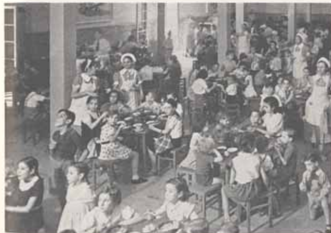
Corner of a children's dining room—a former movie-house in Barcelona