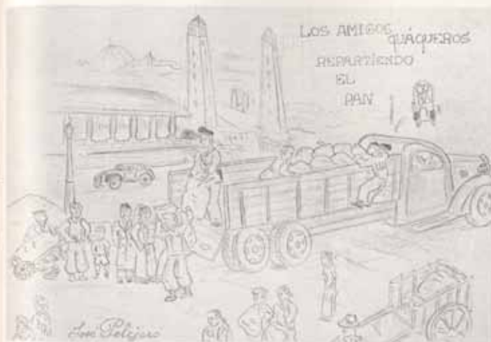
Spanish children express their thanks for American flour in drawings

The great hope of saving Spain's children came when the American Red Cross gave the American Friends Service Committee 60,000 barrels of surplus flour in October, 1938. The wheat was made available by the Federal Surplus Commodities Corporation and the milling and transportation to seaboard was paid for by the Red Cross at the cost of approximately $1.10 per barrel. Ocean transportation to France was furnished free of charge by the United States Maritime Commission and the two Spanish Governments provided the additional transportation to Spain. Immediately governments which had made only token contributions to