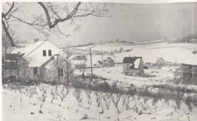
The stone and clapboard houses of Penn-Craft are rapidly nearing completion.

The men voted unanimously that each would contribute one hundred hours of work toward the construction of a building for a sweater factory. This is the first industry in the new community.