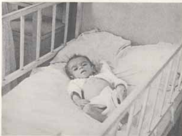
A typically undernourished "war baby" at the Friends' Hospital, Murcia