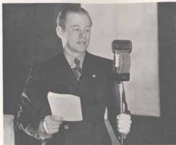
Radio broadcasts gave Peace Volunteers a wide public

The work done in one Mid-Western university last year is illustrative of the winter program. During the year there was a splendid spirit of cooperation between the college and city peace workers. Regular round-table and discussion groups met throughout the winter. The city was mapped off into sections, and mimeographed peace material distributed by college workers at regular intervals. Peace movies were presented both on and off the campus. A dramatic Unit put on a peace play at the college and in fifteen surrounding communities. A new library shelf for peace books and literature was installed. Students in groups of two or three went into churches and clubs with peace programs, addresses, plays and panel discussions during the week-ends. An attempt was made to get a definite peace committee established in each organization