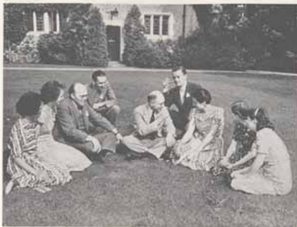
Much is learned through informal discussions at Institutes of International Relations