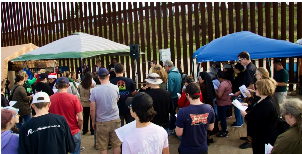
Posada sin Fronteras at the U.S.-Mexico border in San Diego