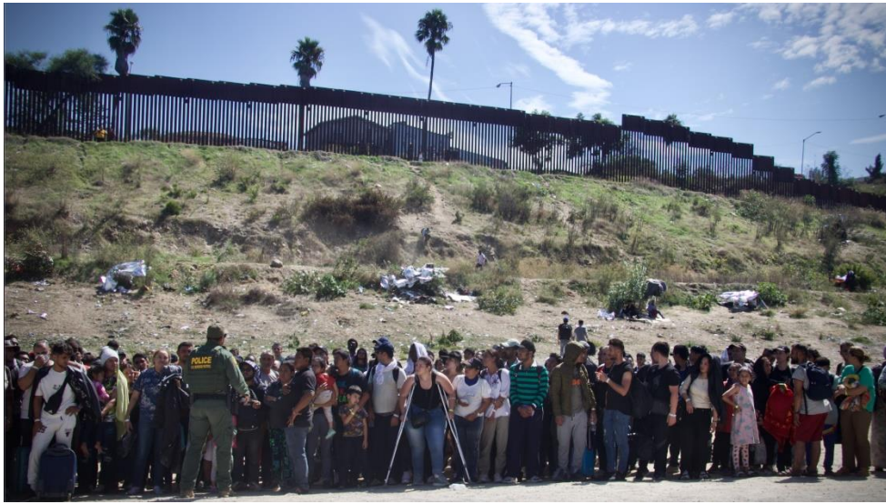
People held at the border