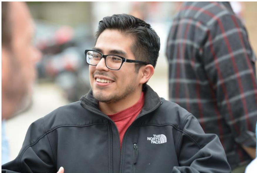
Hector Salamanca in 2015