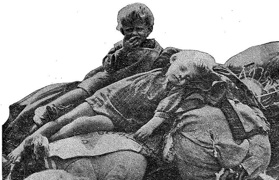
GERMAN EXPELLEES IN TRANSIT

concerning the FLIGHT AND EXPULSION OF GERMAN MINORITIES IN EASTERN EUROPE