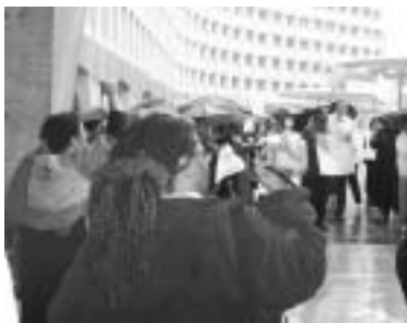
National Low Income Housing Coalition rallies outside HUD

In addition to putting tenants directly at risk, the funding crisis may well make landlords less interested in leasing to potential tenants that have Section 8 vouchers. And it may make lenders (banks and tax credit investors) question the viability of new construction projects that intend to rent to voucher holders.